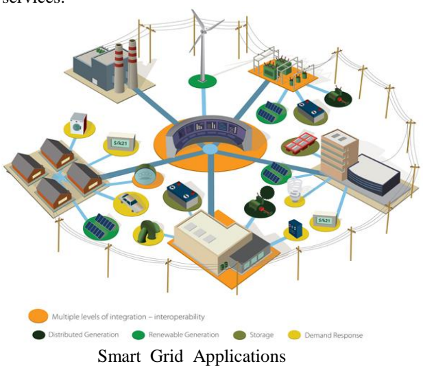
Survey of implementation of Smart Grid

protection, and security and privacy protection services.